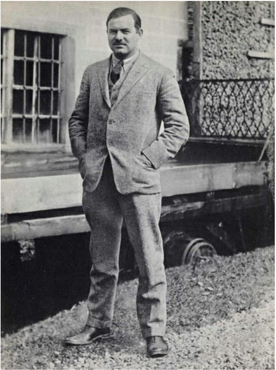
9. Ernest Hemingway in the late 1920's