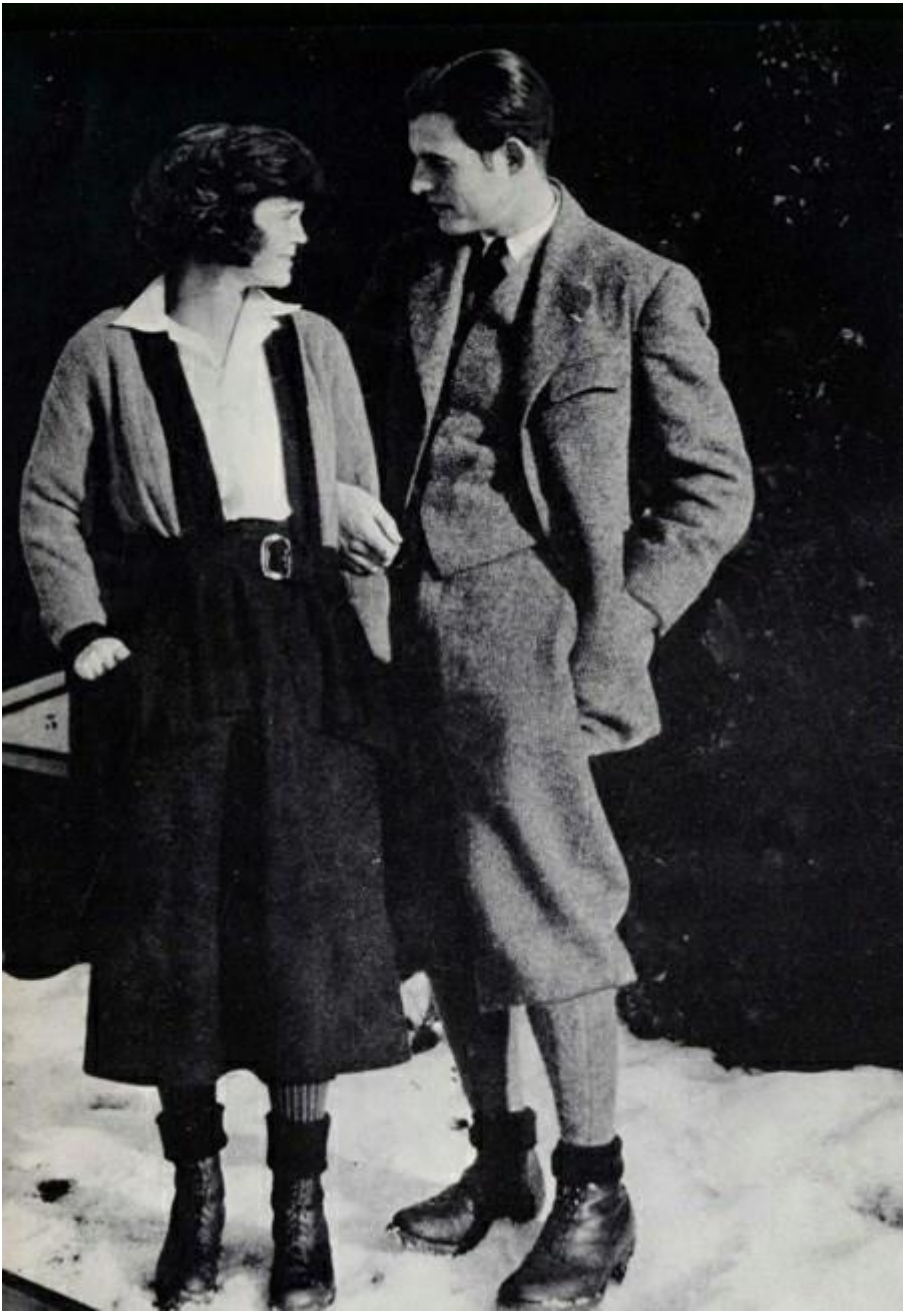
2. Hadley and Ernest Hemingway