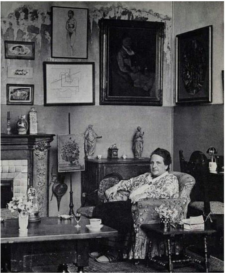
3. Gertrude Stein in her Paris apartment, 27 rue de Fleurus