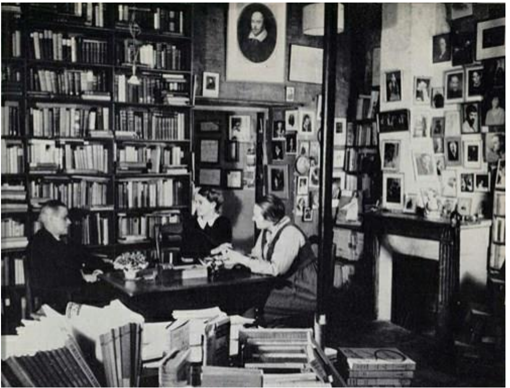
5. Interior of the bookshop showing James Joyce, with Sylvia Beach and Adrienne Monnier