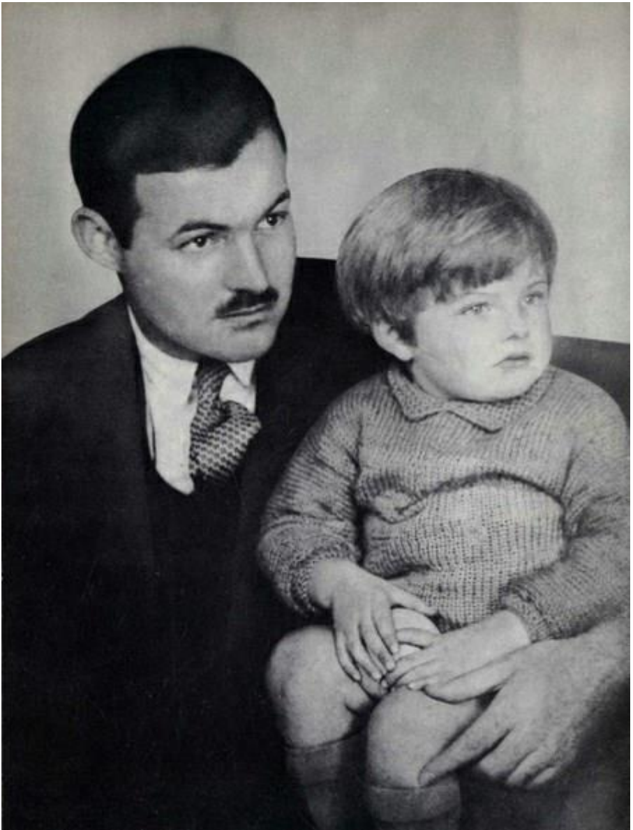
7. Ernest Hemingway and Bumby