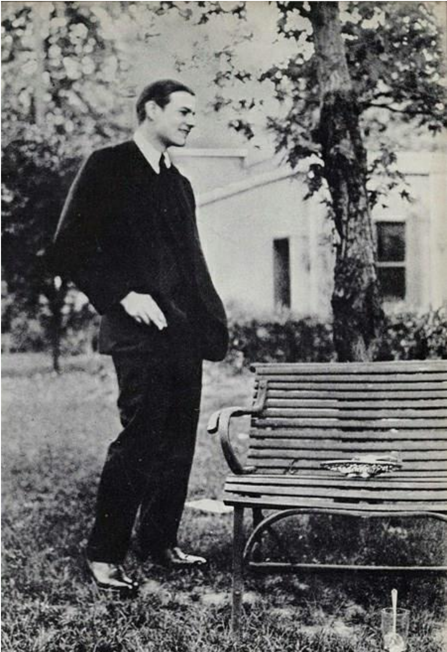
1. Ernest Hemingway as a young man